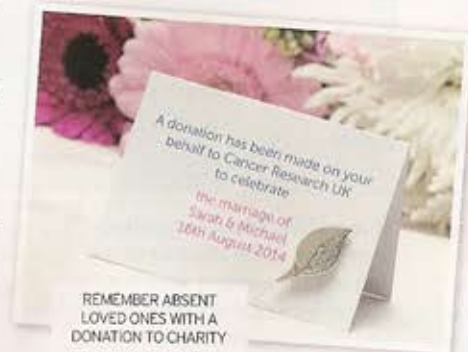
REMEMBER ABSENT LOVED ONES WITH A DONATION TO CHARITY

Alternatively, you can set up a Give in Celebration fundraising page and ask guests to donate instead of, or alongside, a traditional gift list. For more information, visit sayido.org