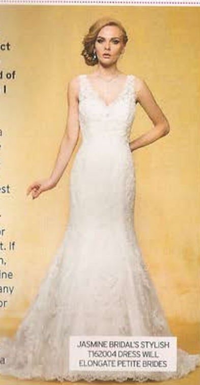
JASMINE BRIDAL'S STYLISH T162004 DRESS WILL ELONGATE PETITE BRIDES

Tara: Regardless of your shorter stature, there are a number of options to make you look and feel stunning. The key is to create a long line from top to toe. The best shape for this is a V-neck dress with straps, on either a column, modified A-line or very gradual fit-n-flare skirt. If you prefer a strapless gown, choose a sweetheart neckline instead of a straight one - any detail cutting across you, for example a large sash, will shorten your appearance. You can also lengthen your look with a dress featuring a vertical design or pleating.