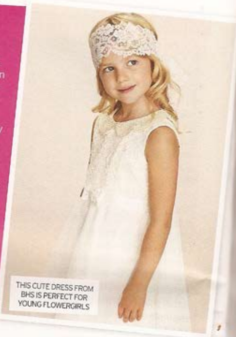
THIS CUTE DRESS FROM BHS IS PERFECT FOR YOUNG FLOWERGIRLS

department stores are a really good starting place - BHS, Debenhams and John Lewis all have super-cute pieces, perfect for little ones. I also adore Monsoon - they have a whole host of adorable dresses and accessories for flowergirls of all ages. Hit the shops with the girls and have a fun day shopping! If you're still struggling for inspiration, see this issue's cute flowergirl gallery on p153. Good luck!