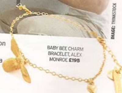
BABY BEE CHARM BRACELET, ALEX MONROE £195

or reception. A special mention or promise to the children as part of your wedding vows is a wonderful way to show them how much they mean to you and your bride.