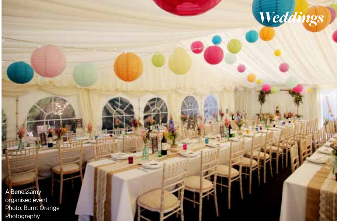
A Benessamy organised event