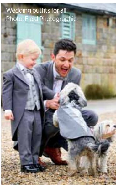
Wedding outfits for all!