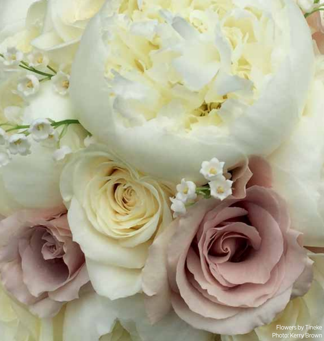
Flowers by Tineke